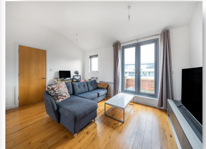
8 Hampshire Lodge, Courtlands, Maidenhead SL6 2PS