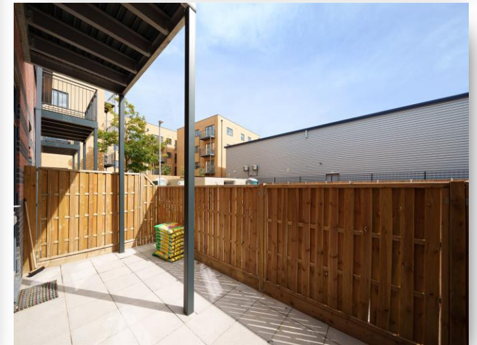
Flat 7 Marlborough House, Clivemont Road, Maidenhead SL6 7TP