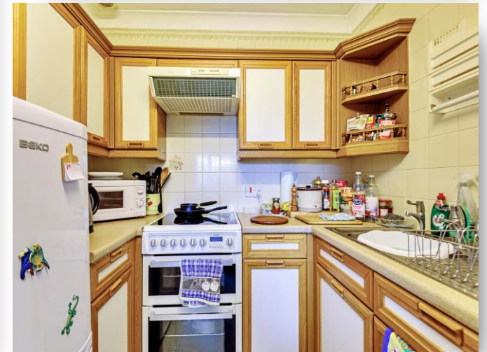
Flat 45 Swanbrook Court, Bridge Avenue, Maidenhead SL6 1YZ