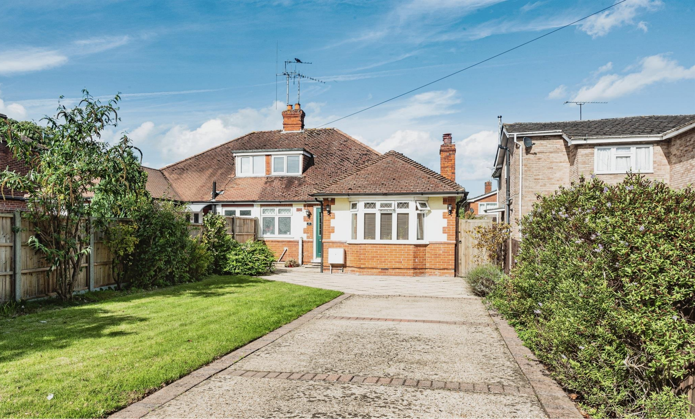
Shepherds Hill, Earley Reading RG6 1BB