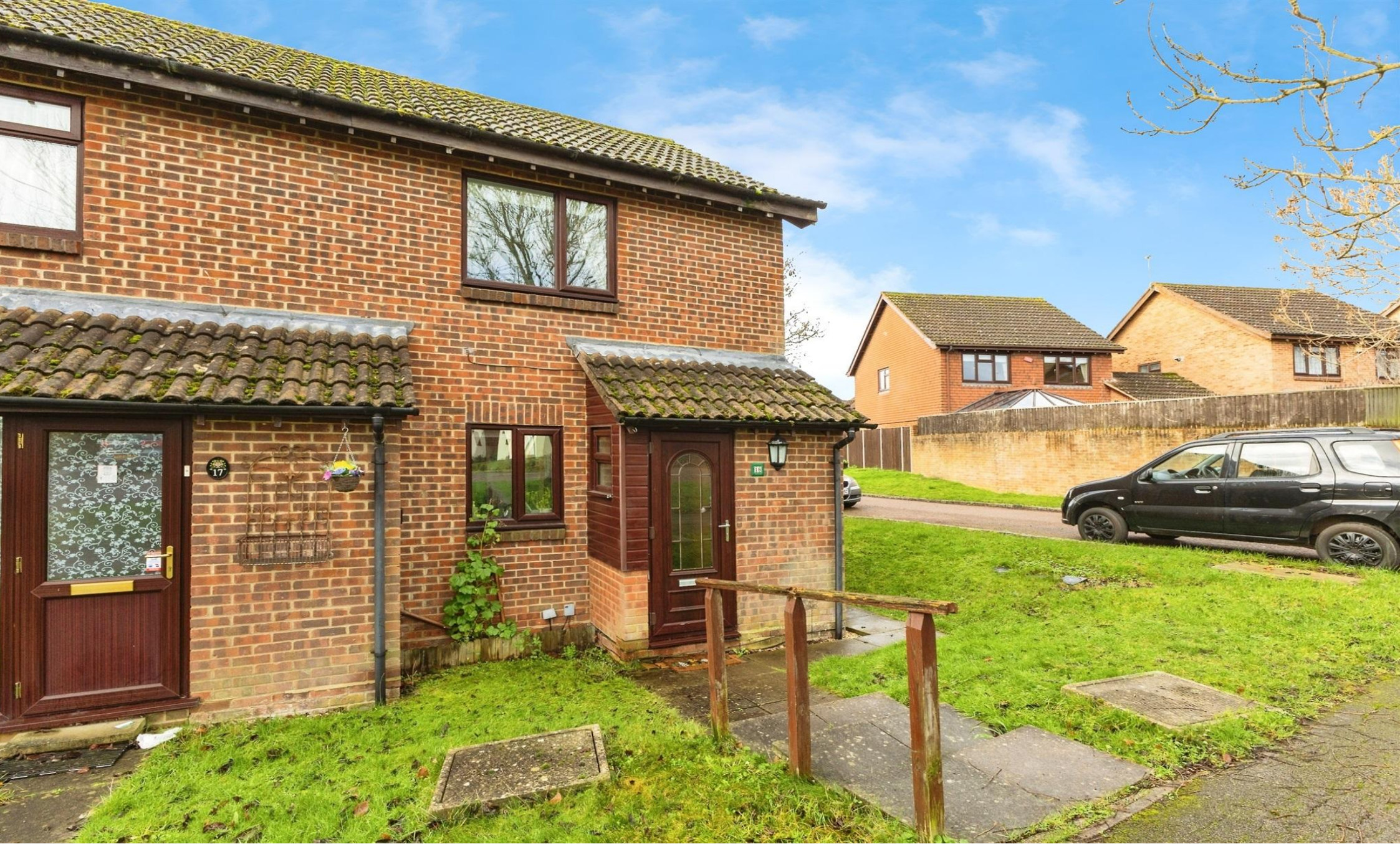
Chicory Close, Earley Reading RG6 5GS