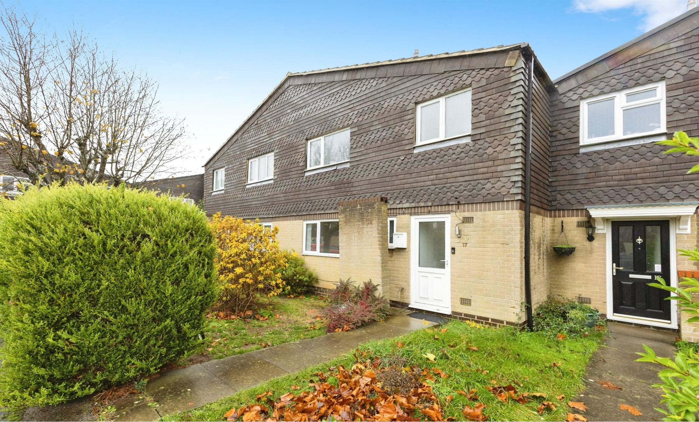
Village Close, READING RG2 8PE