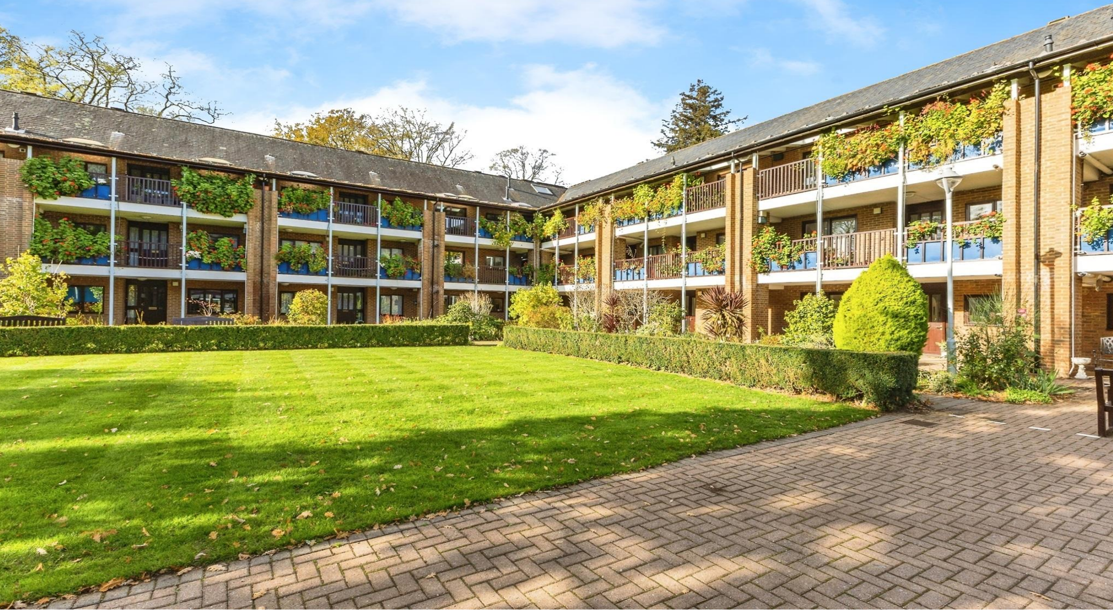
Emmbrook Court, Reading RG6 5TZ