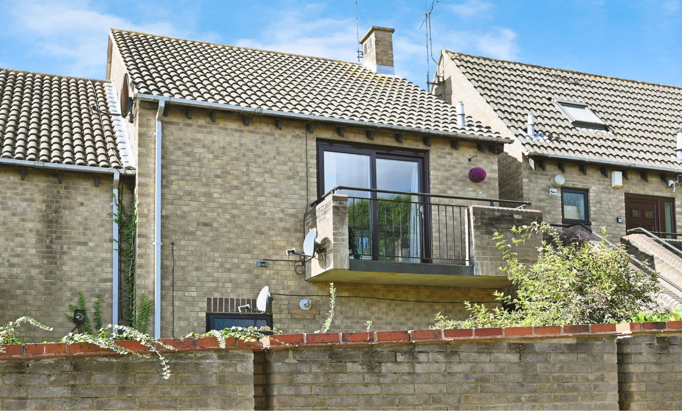
Maiden Place, Lower Earley Reading RG6 3HA