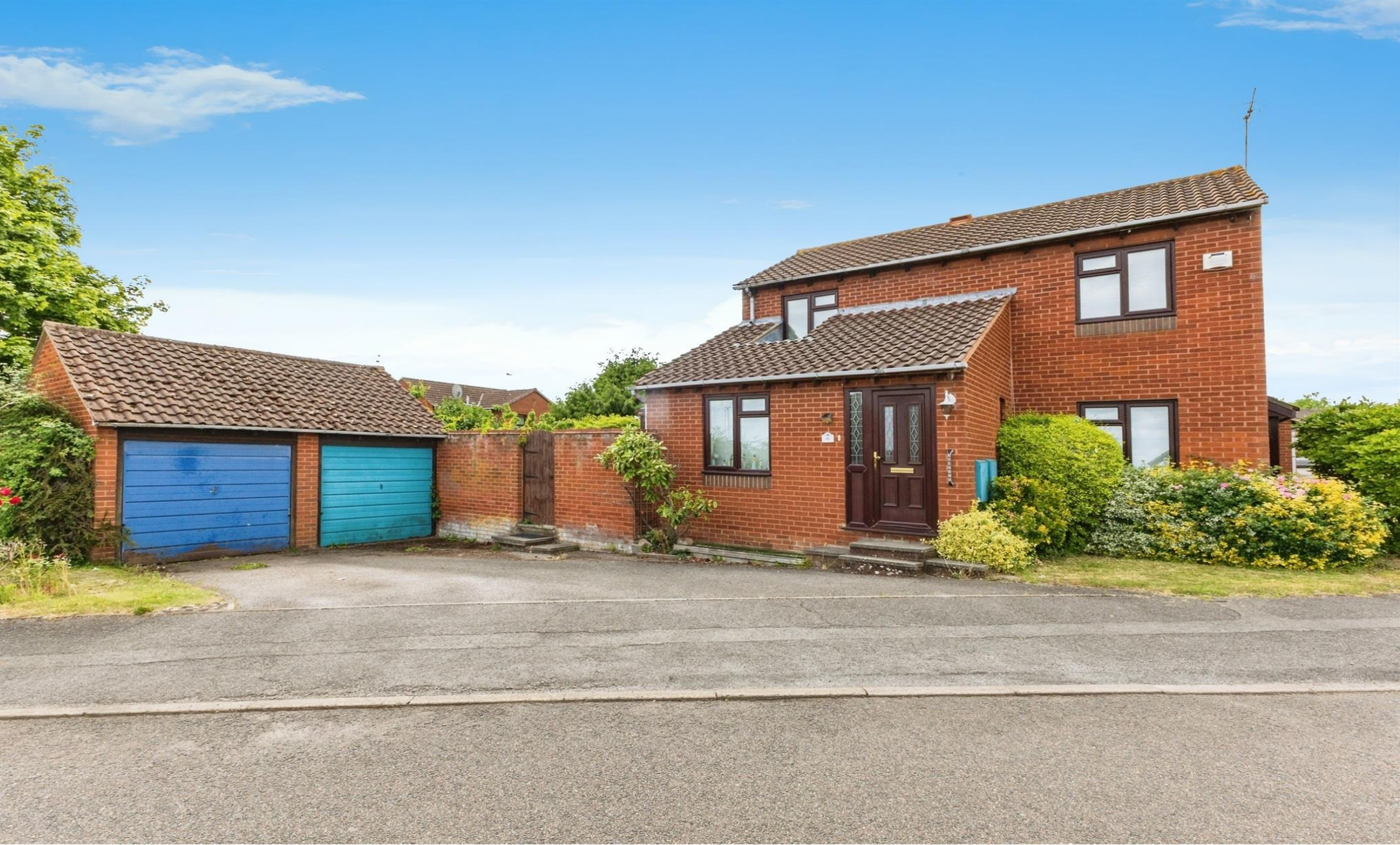
Bridport Close, Lower Earley Reading RG6 3DG