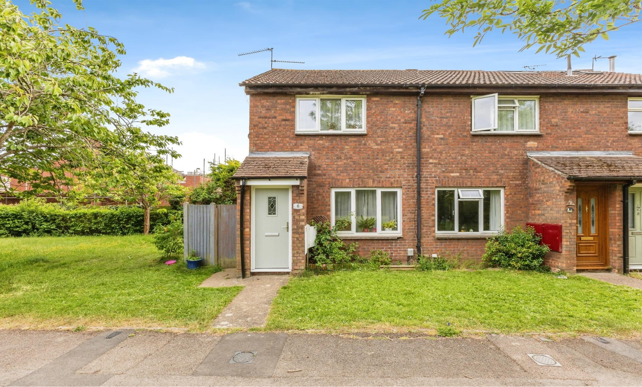
Flamborough Path, Lower Earley Reading RG6 3XD