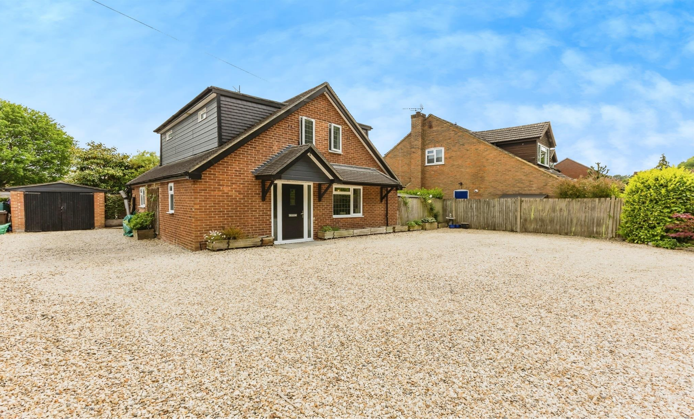
Simons Lane, Wokingham RG41 3HG