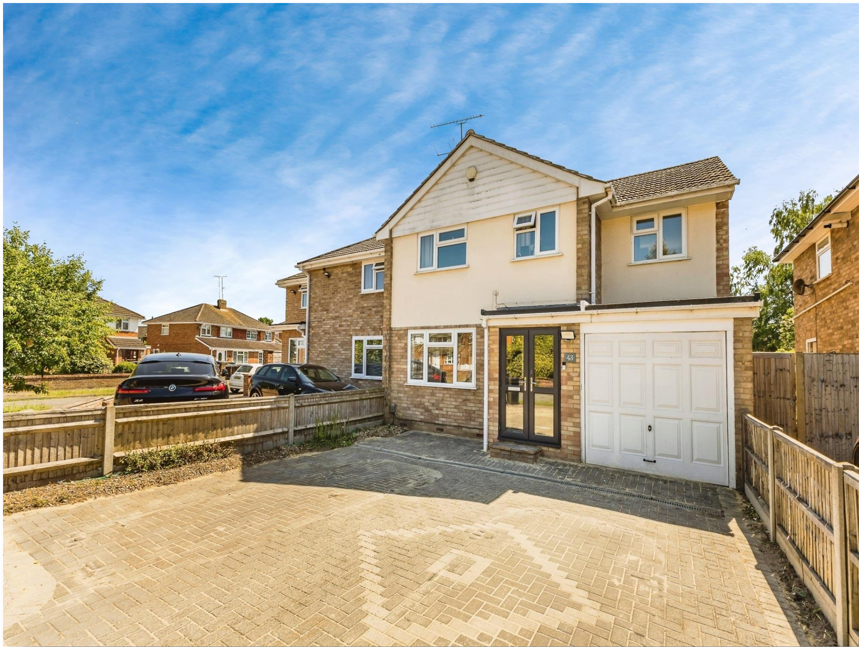
Antrim Road, Woodley READING RG5 3NT