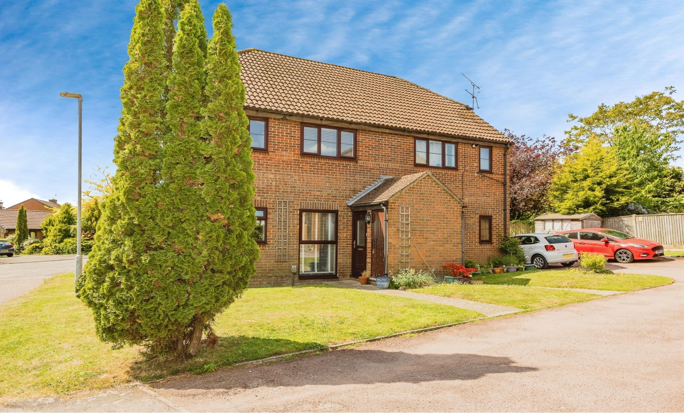
Parsley Close, Earley Reading RG6 5GN