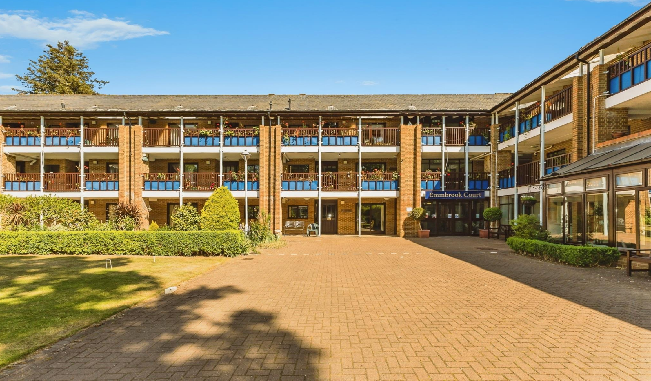
Emmbrook Court, Reading RG6 5TZ