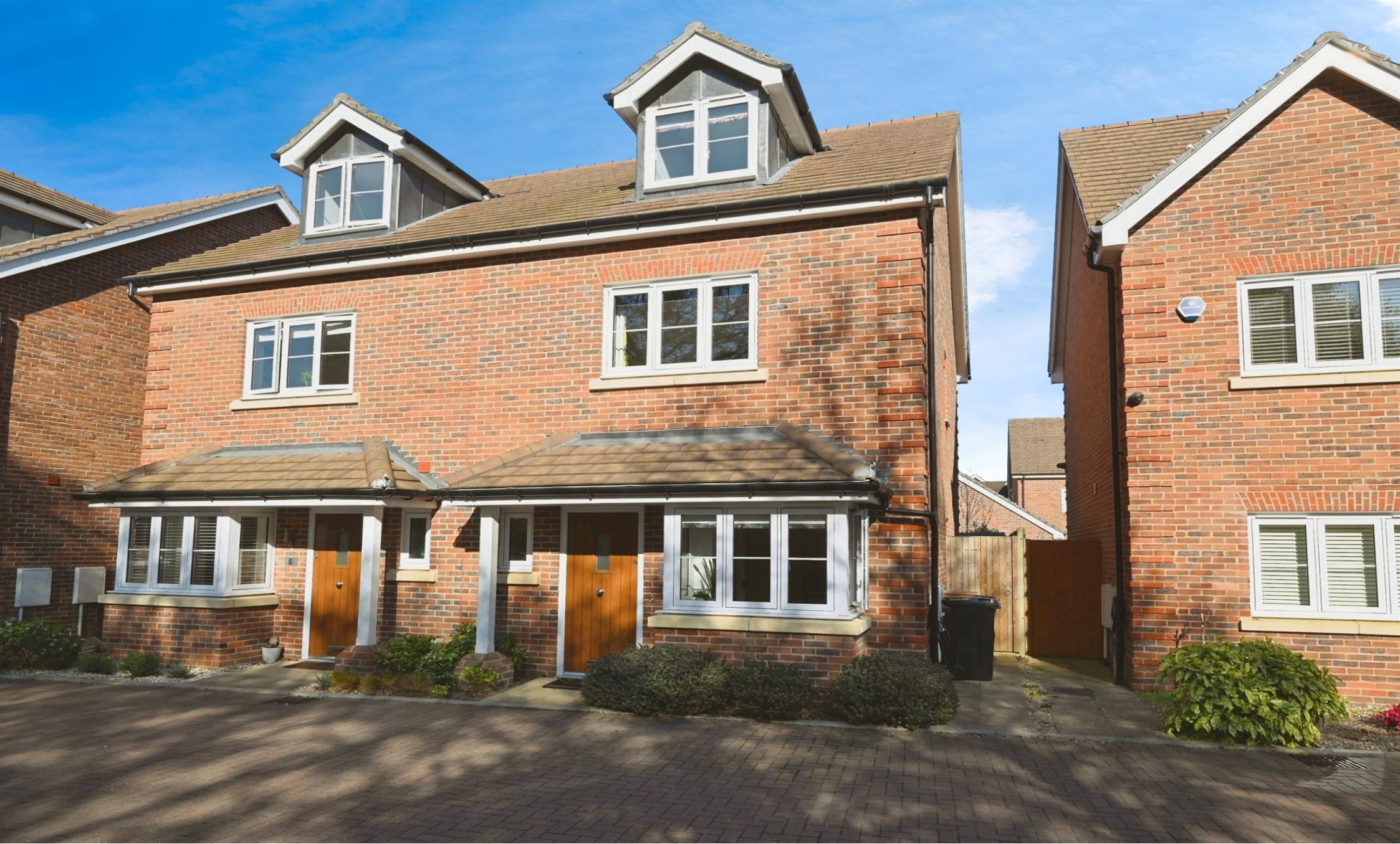
Rose Grove, Woodley Reading RG5 4FL