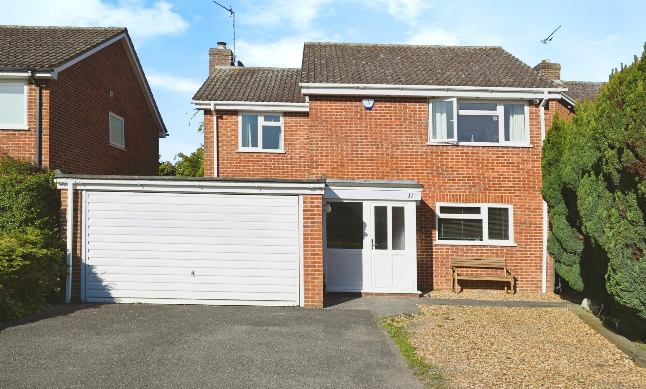
Lincoln Close, Winnersh Wokingham RG41 5SZ