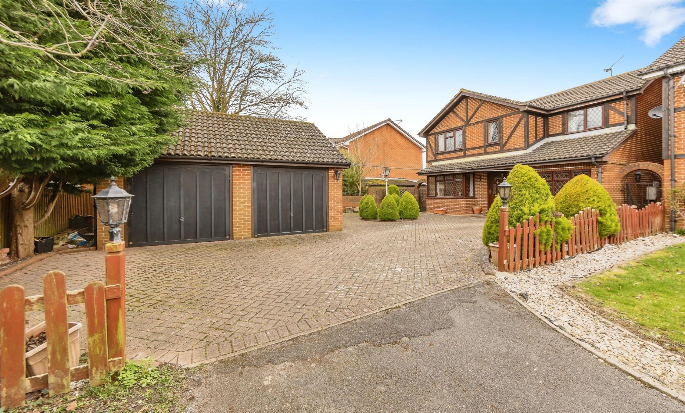
Littington Close, Lower Earley Reading RG6 4BL