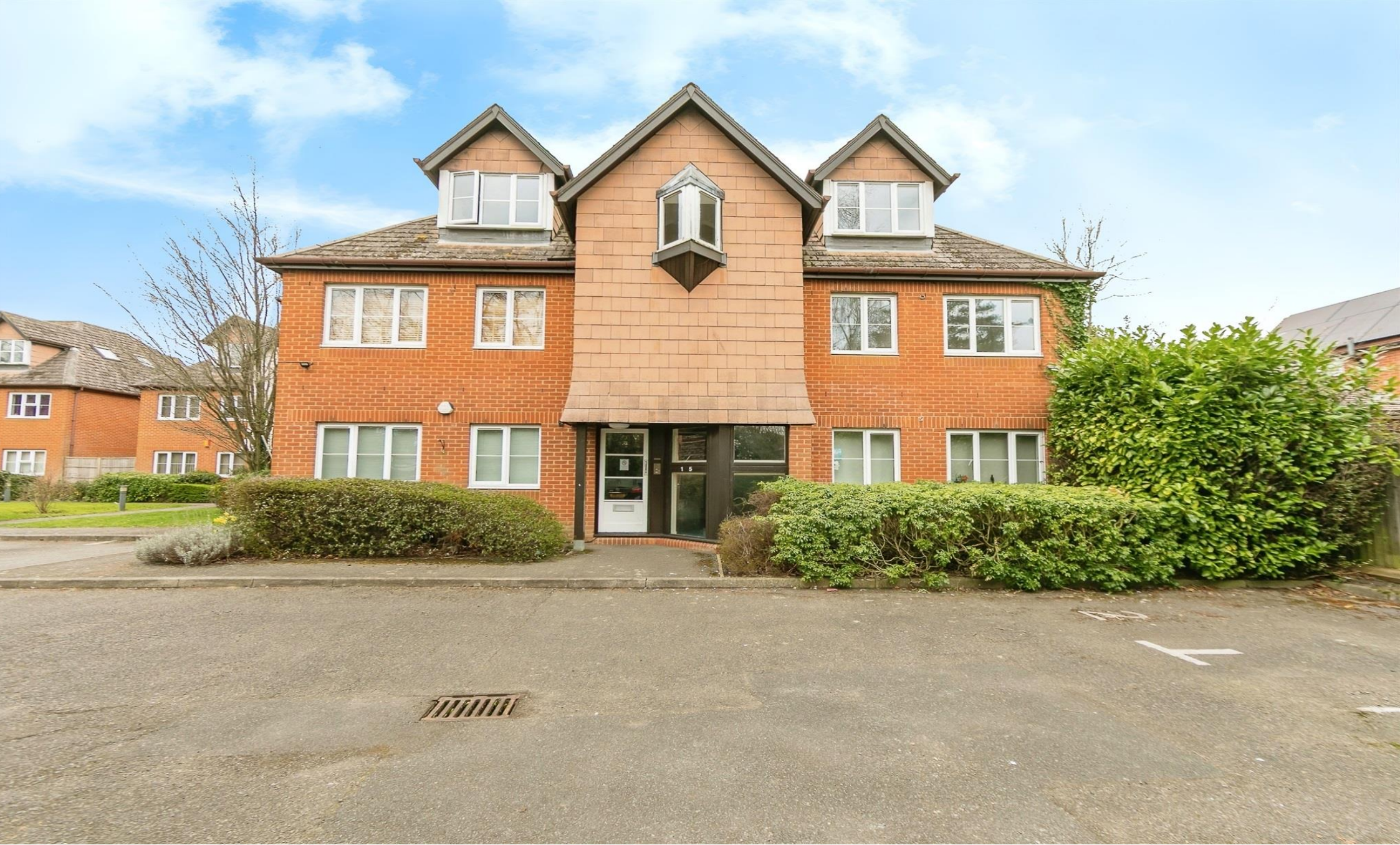
Mansell Court, READING RG2 7DZ