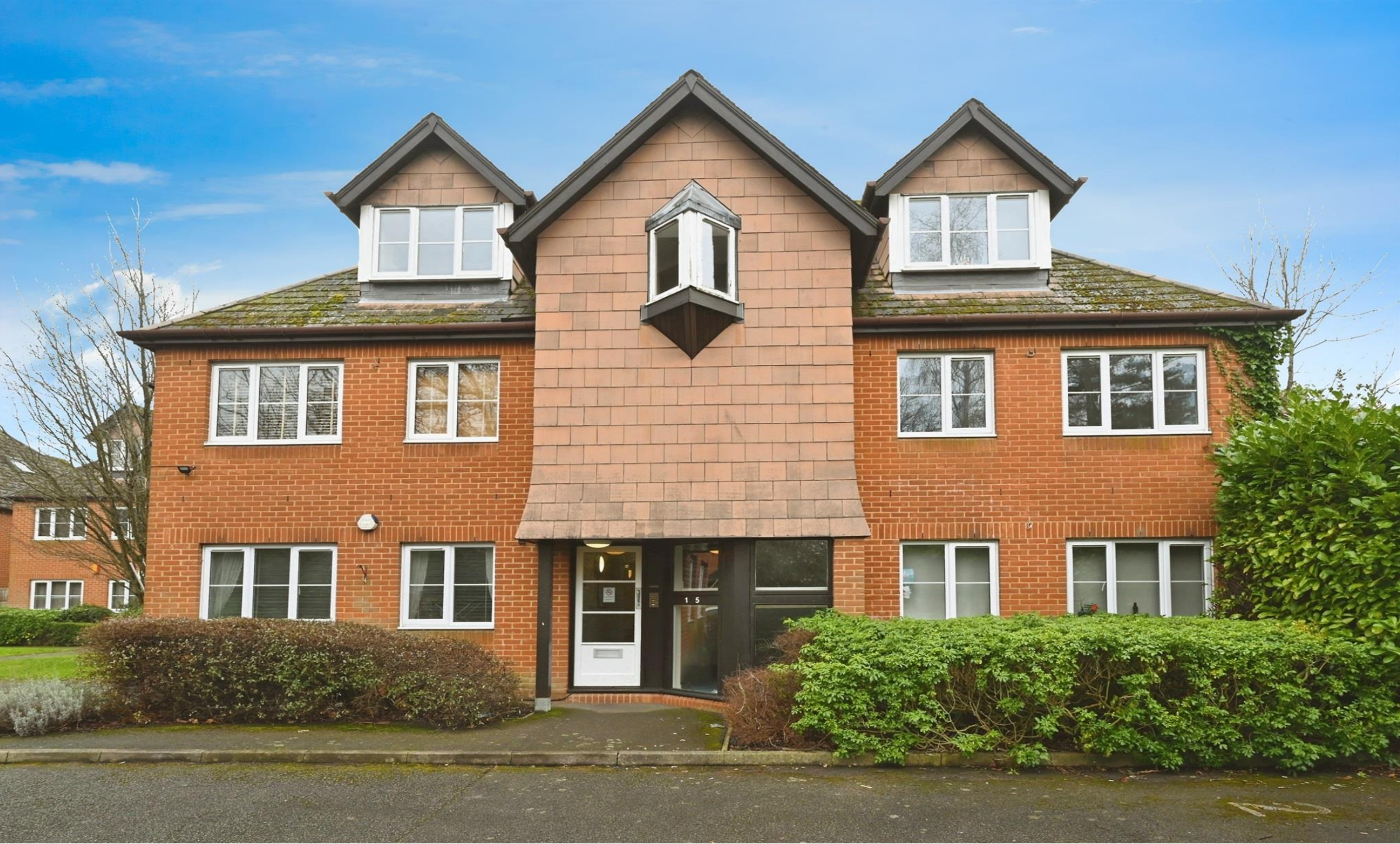
Mansell Court, READING RG2 7DZ