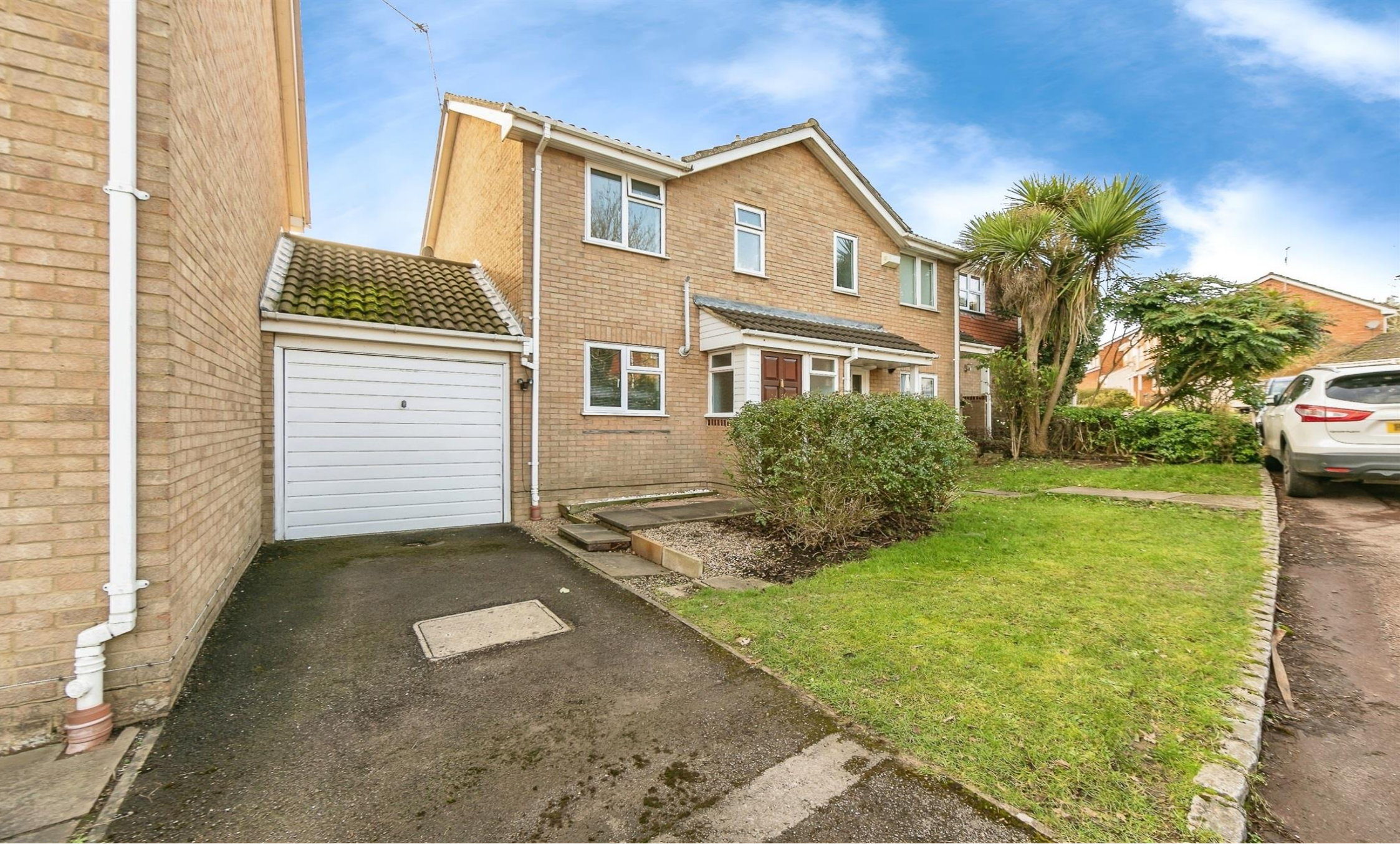
Fakenham Close, Lower Earley READING RG6 4AB