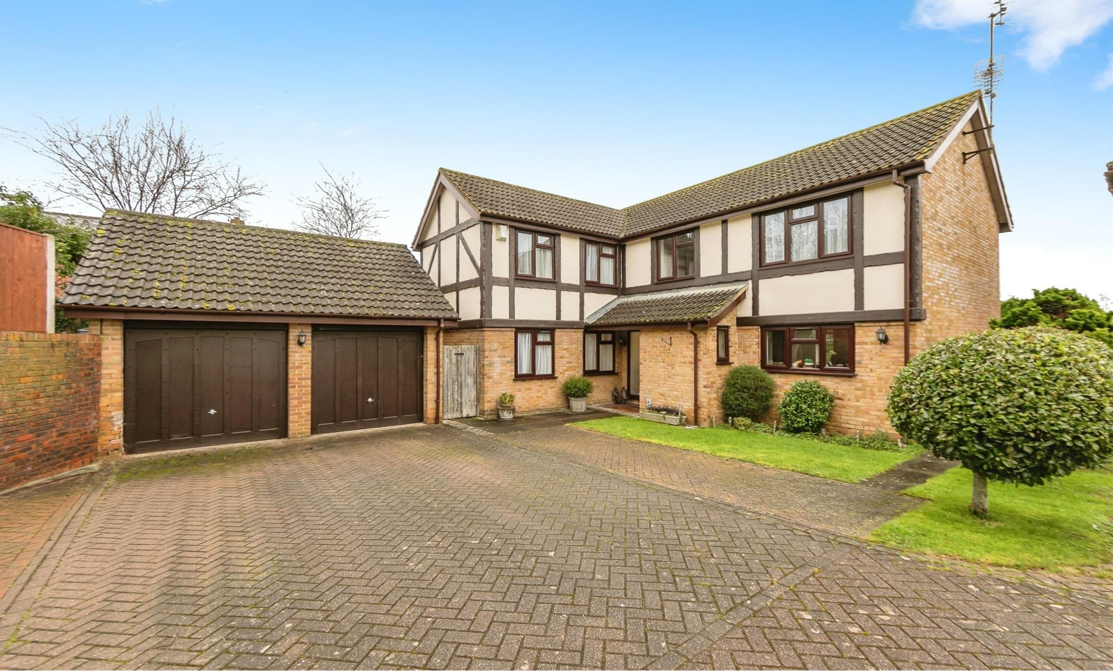
Rushall Close, Lower Earley Reading RG6 4BG