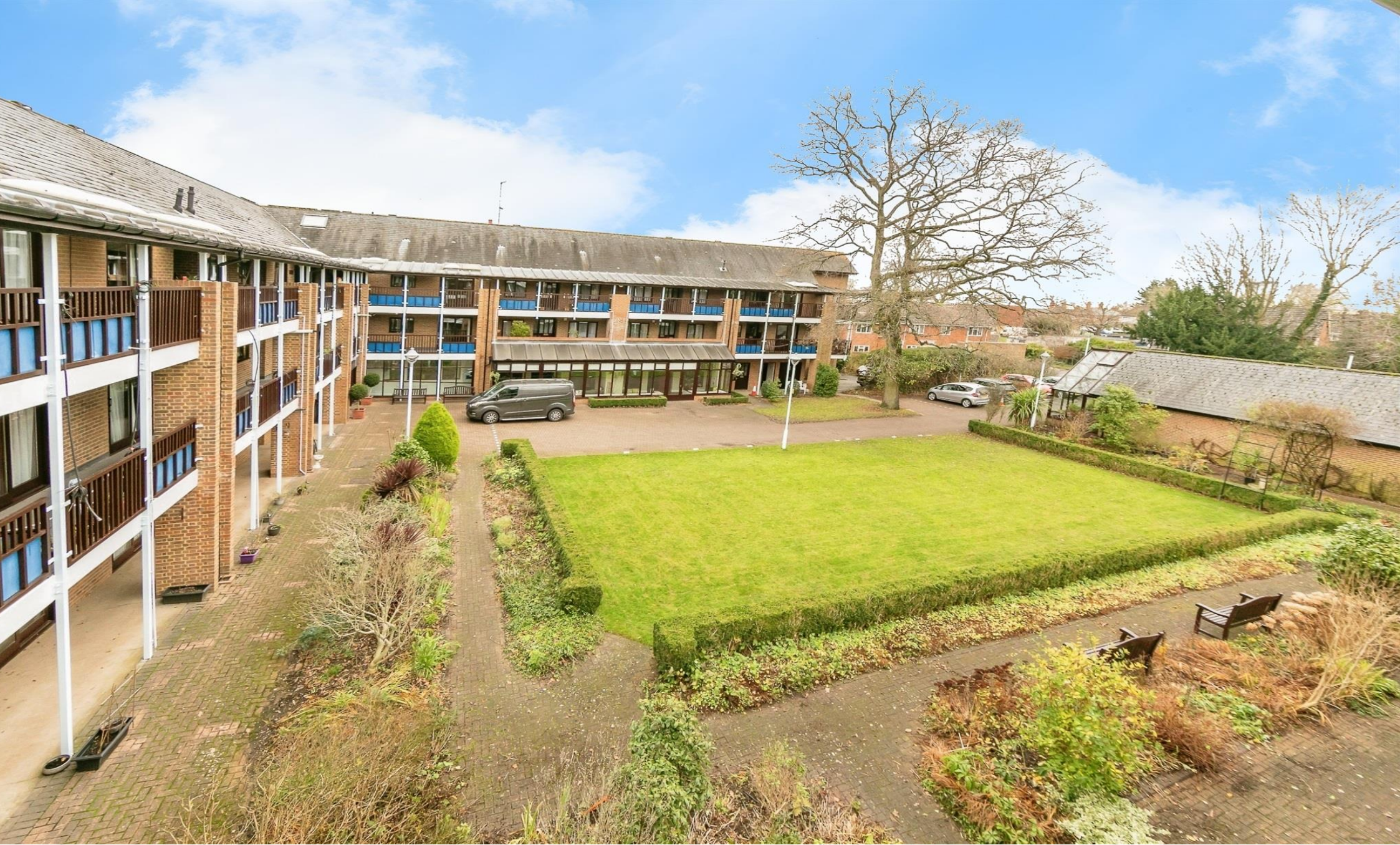
Emmbrook Court, Reading RG6 5TZ