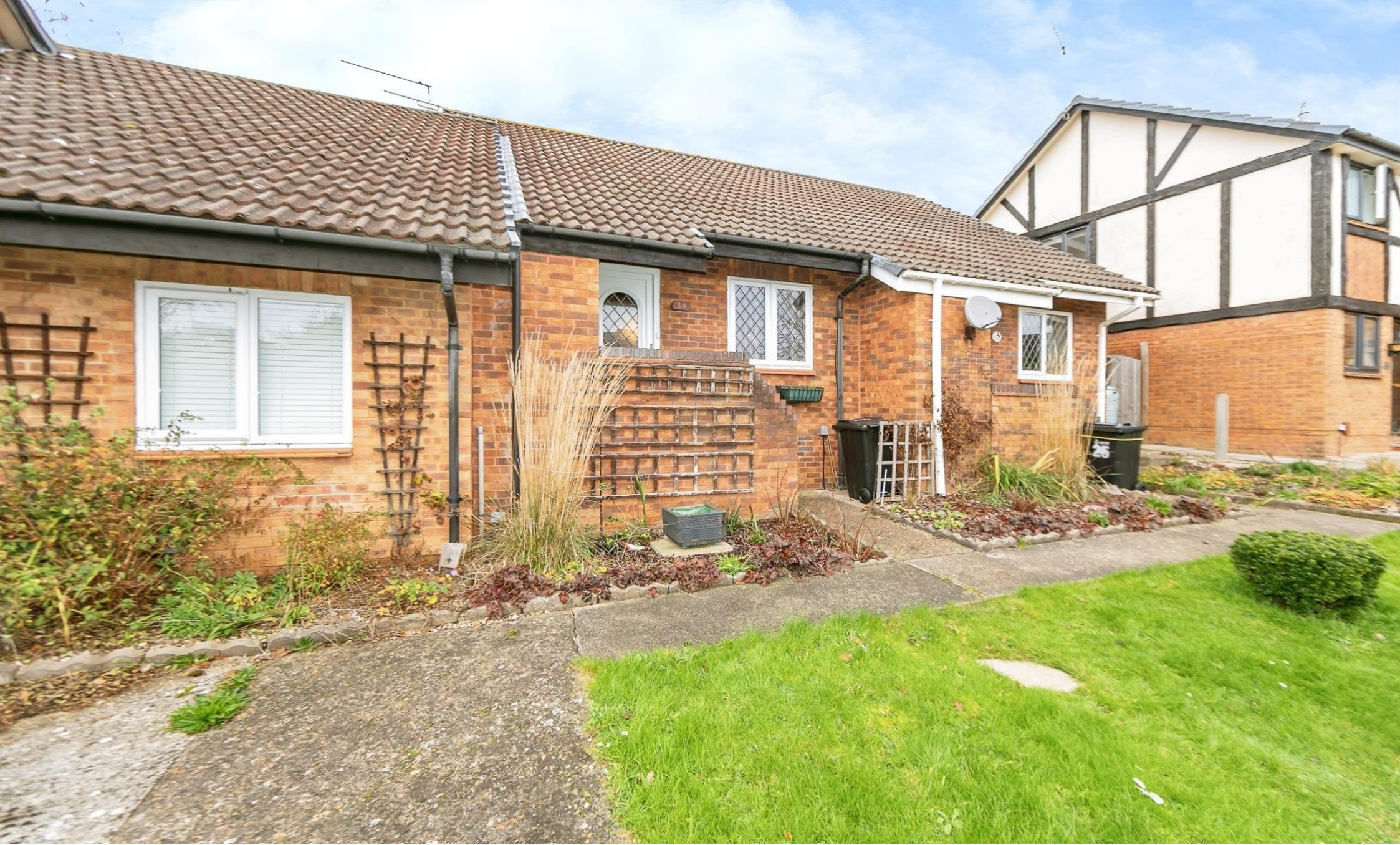
Ratby Close, Lower Earley Reading RG6 4ER