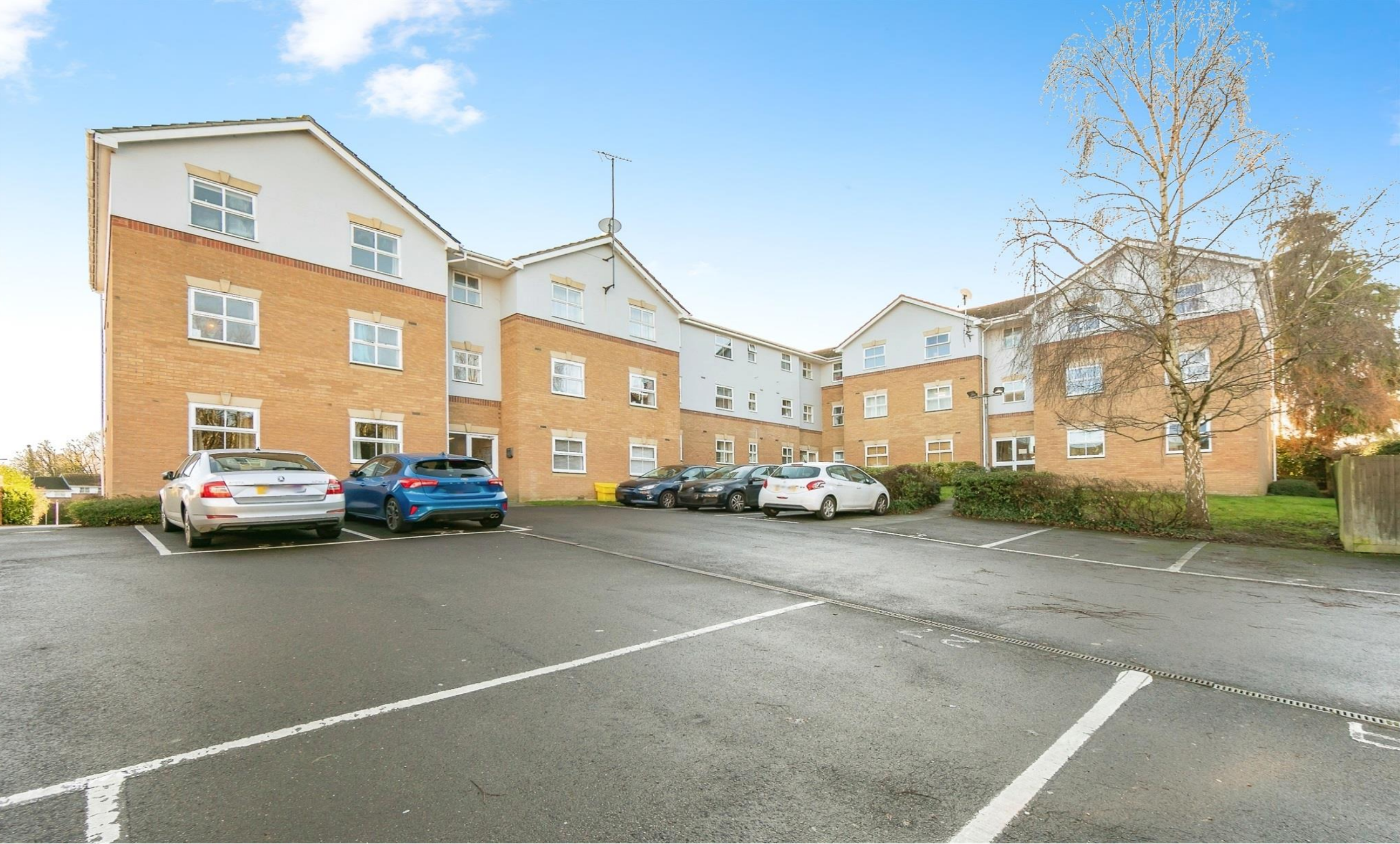
Elm Park, Reading RG30 2HT