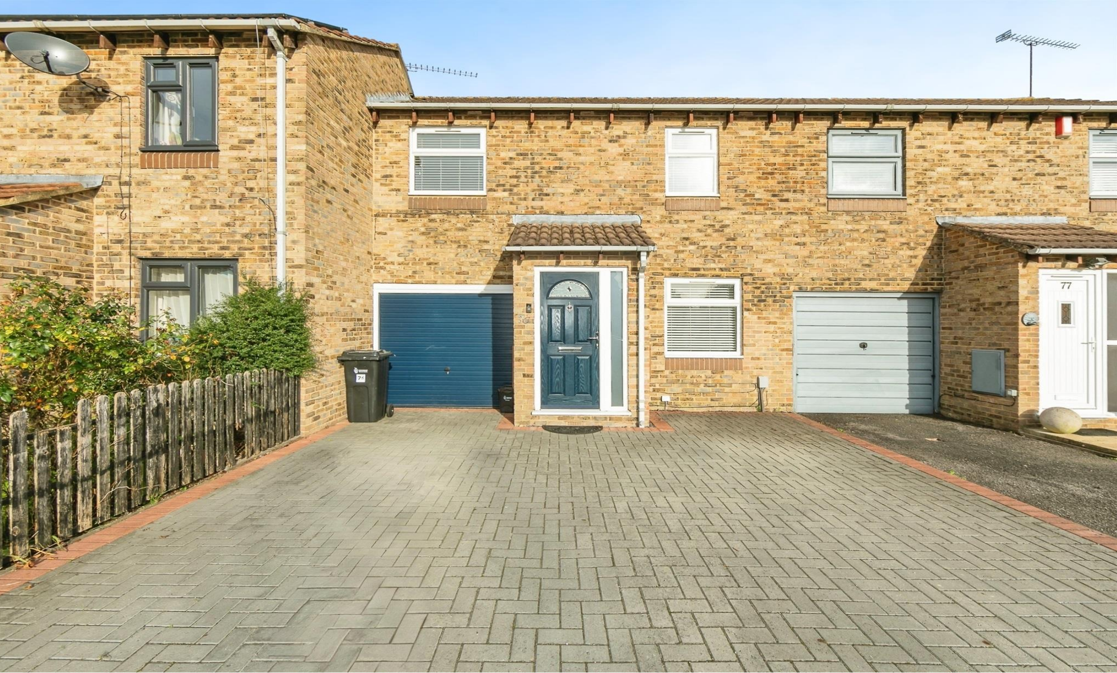
The Delph, Lower Earley Reading RG6 3AW