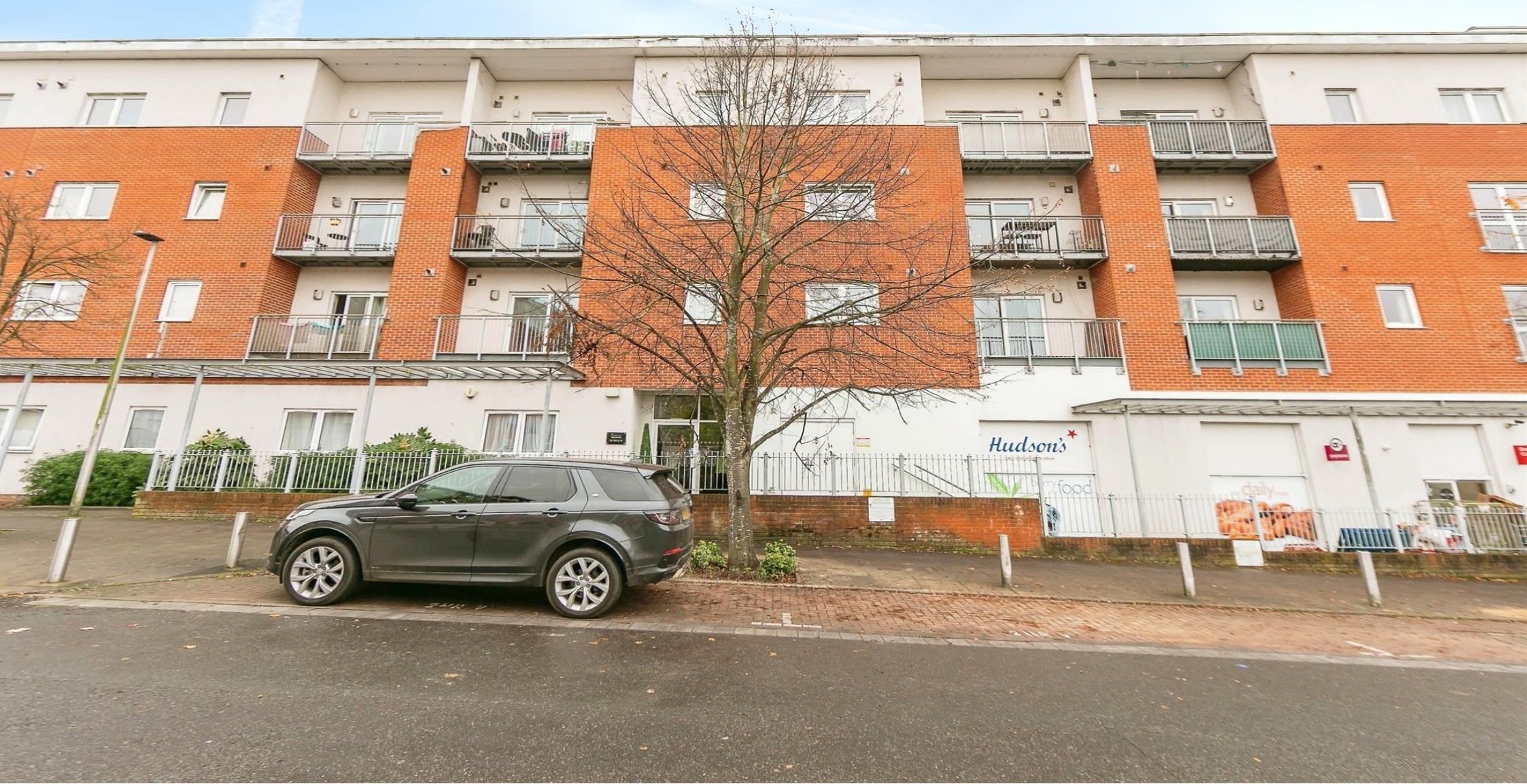
Tean House Havergate Way,READING RG2 0GU