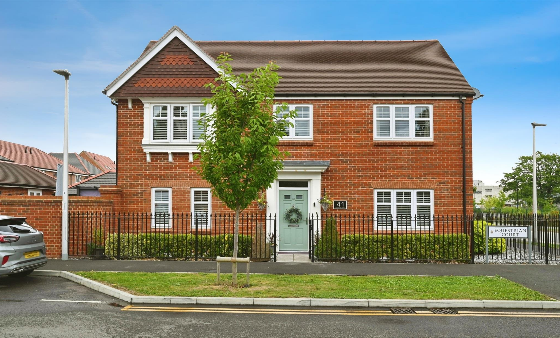
Equestrian Court, Arborfield Green Reading RG2 9ZS