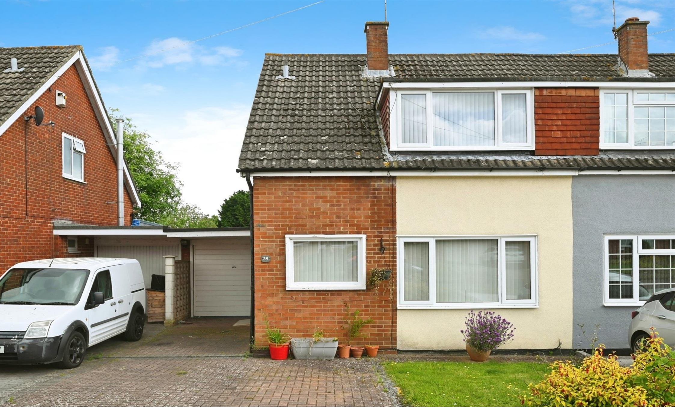
Appletree Lane, Spencers Wood Reading RG7 1EE