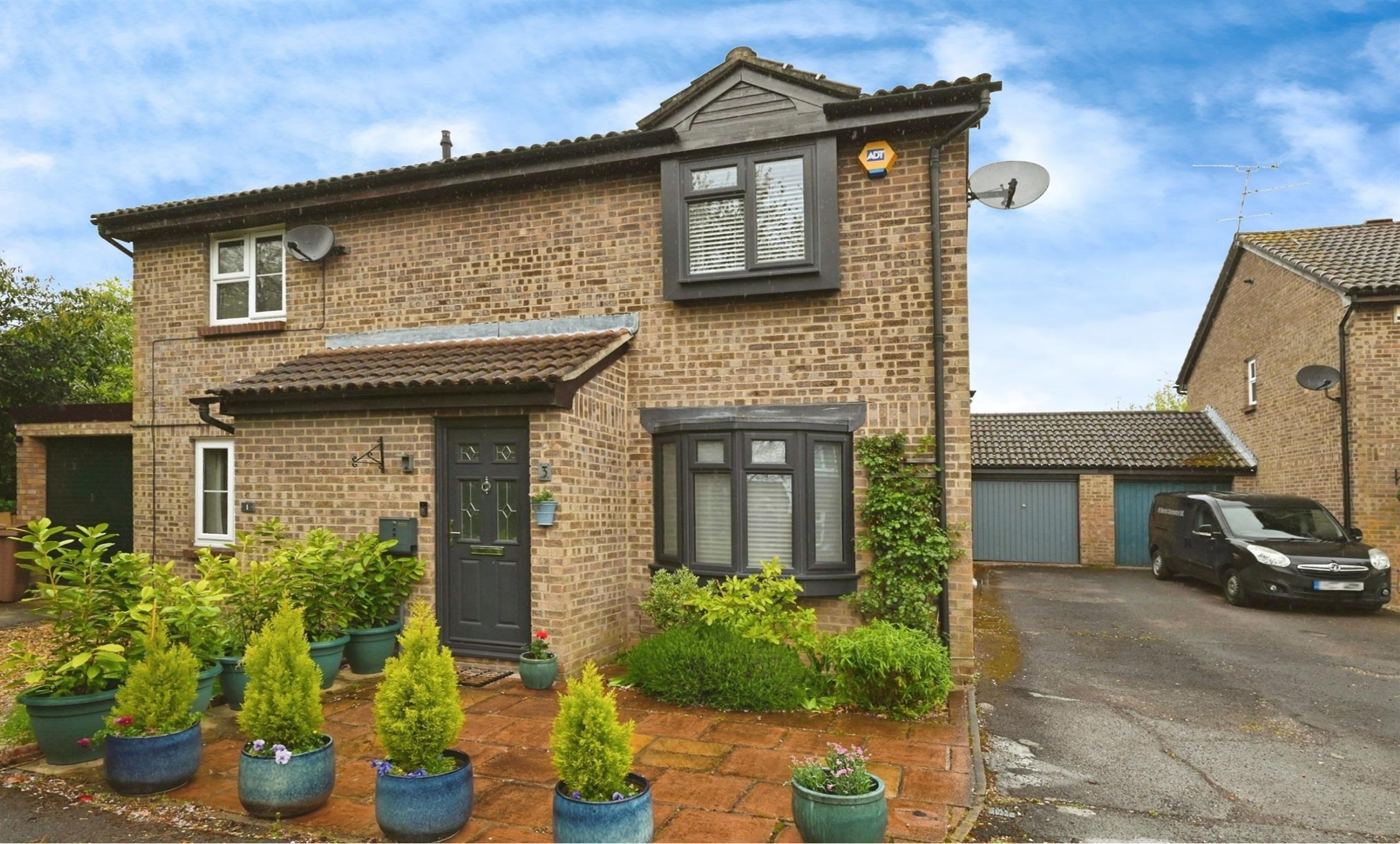
Beighton Close, Lower Earley Reading RG6 4HZ