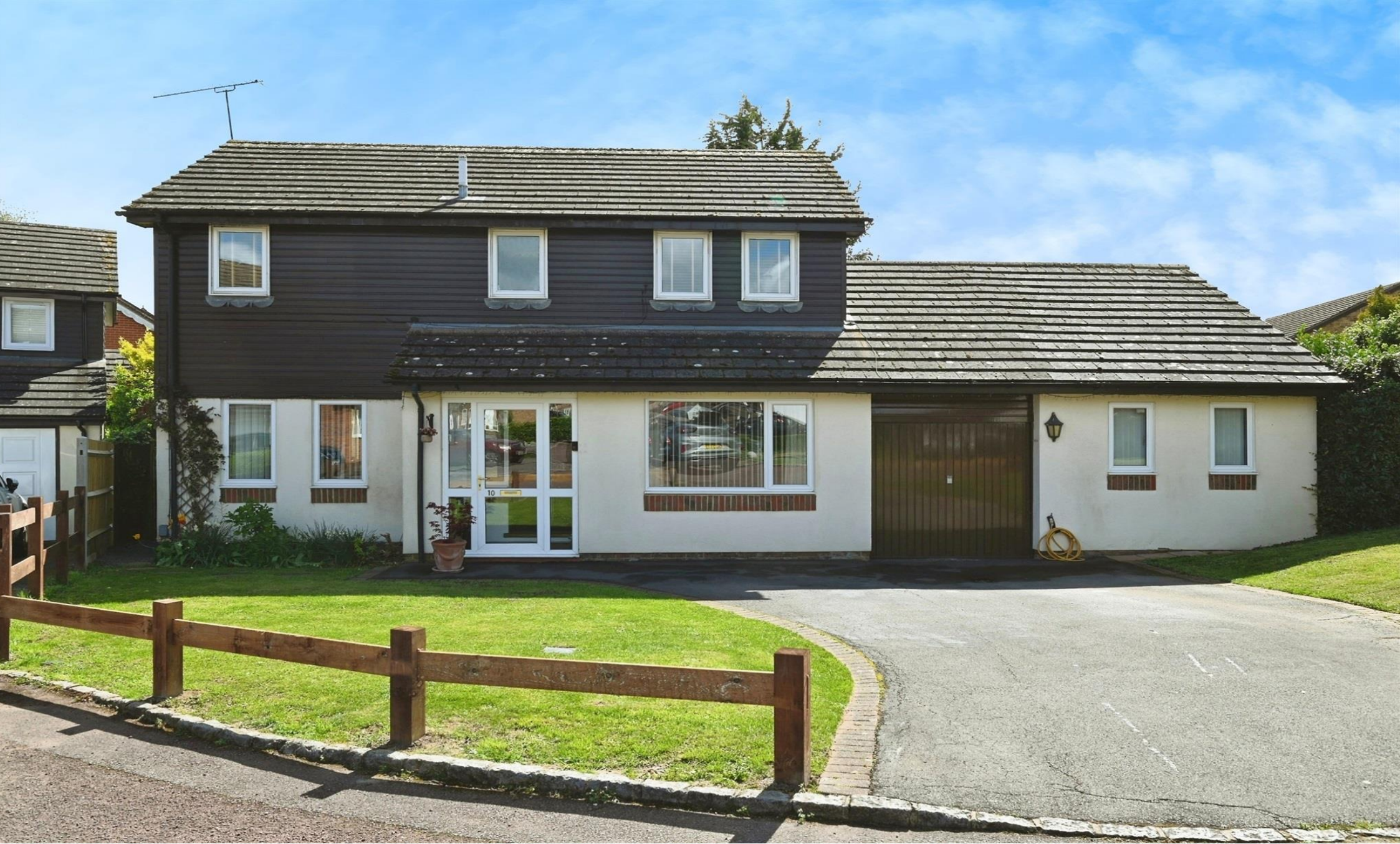
Frieth Close, Earley Reading RG6 5UY