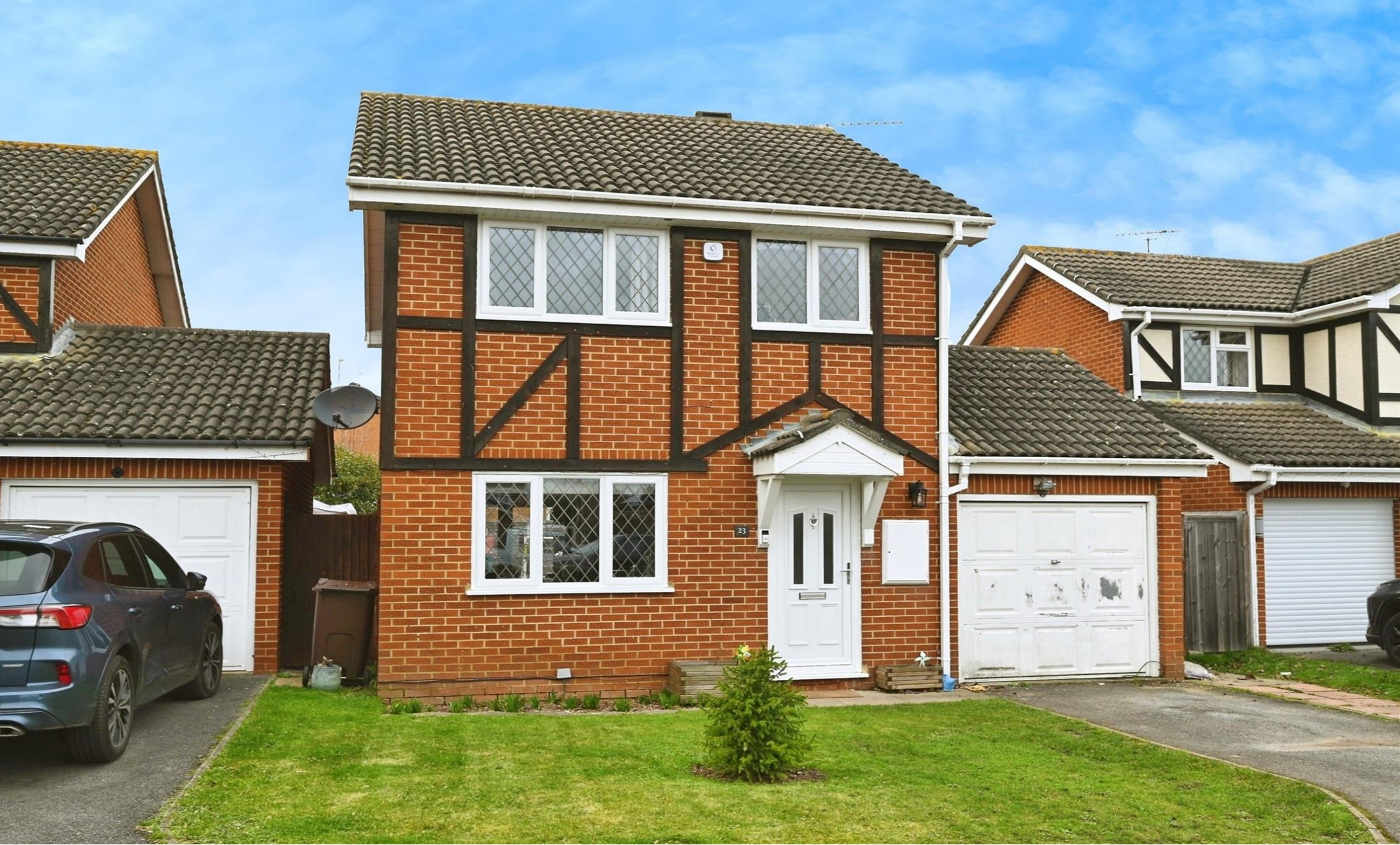
Littington Close, Lower Earley Reading RG6 4BL