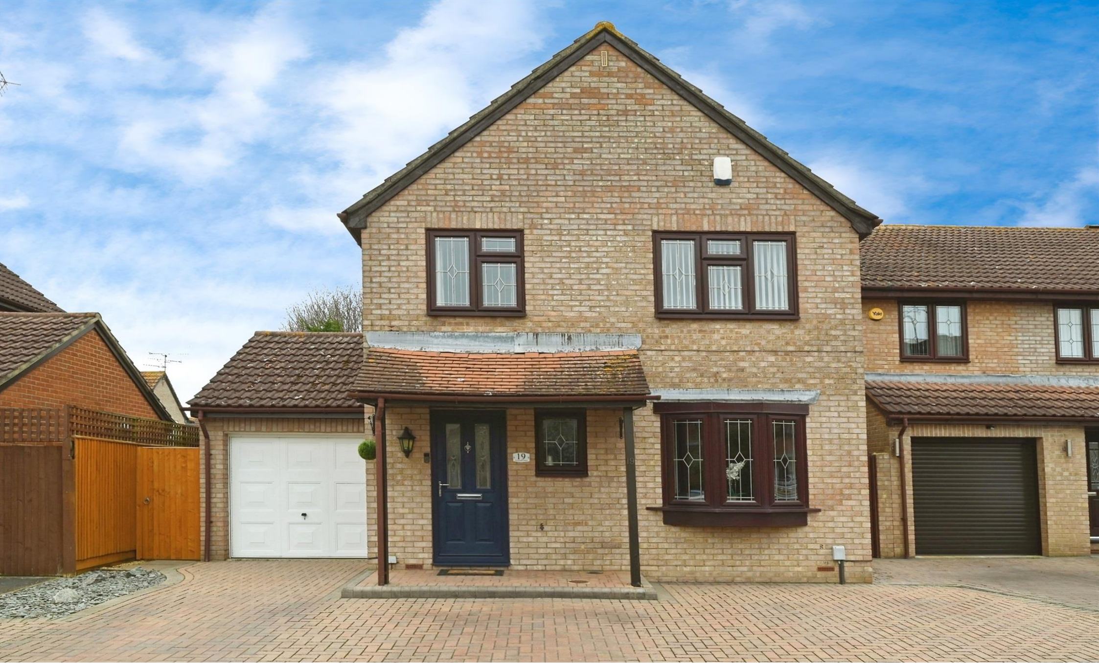
Finstock Close, Lower Earley READING RG6 4JX