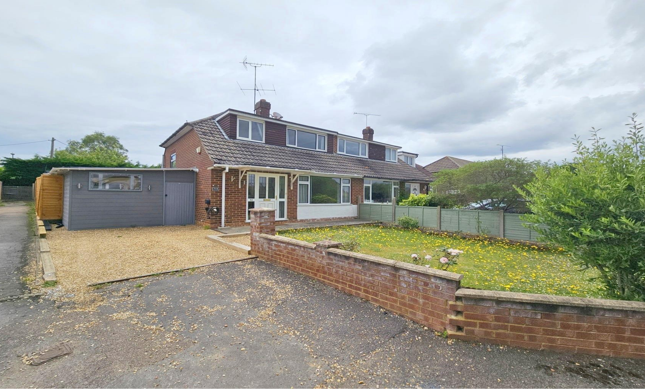
Leyland Gardens, Shinfield Reading RG2 9AN