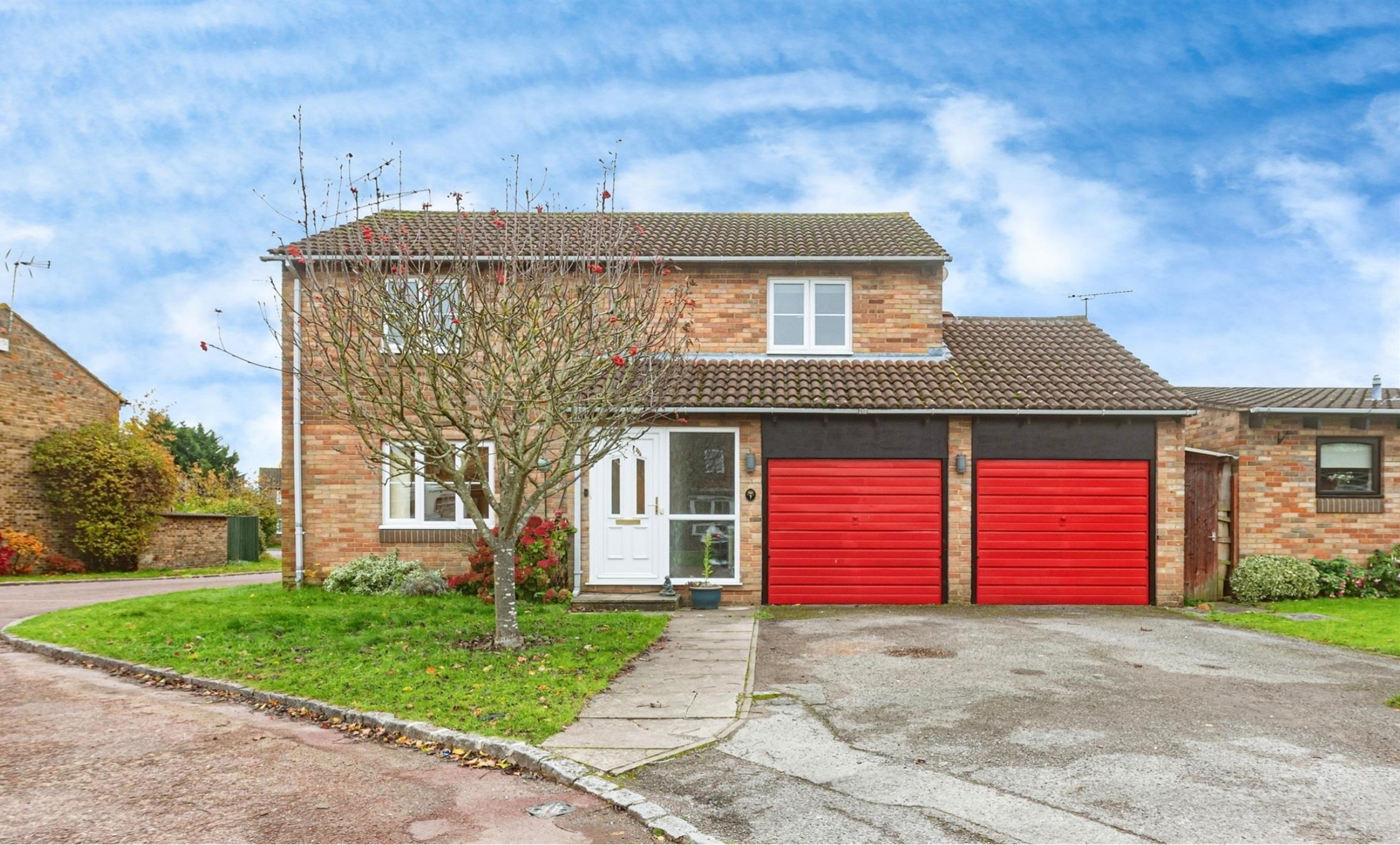
Bythorn Close, Lower Earley Reading RG6 3BH