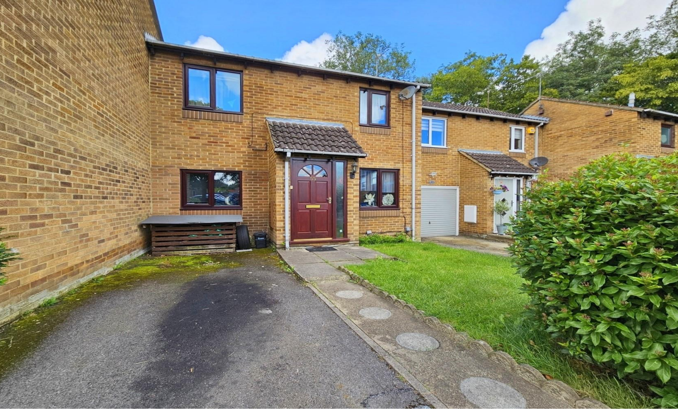
Sellafeld Way, Lower Earley Reading RG6 3BT