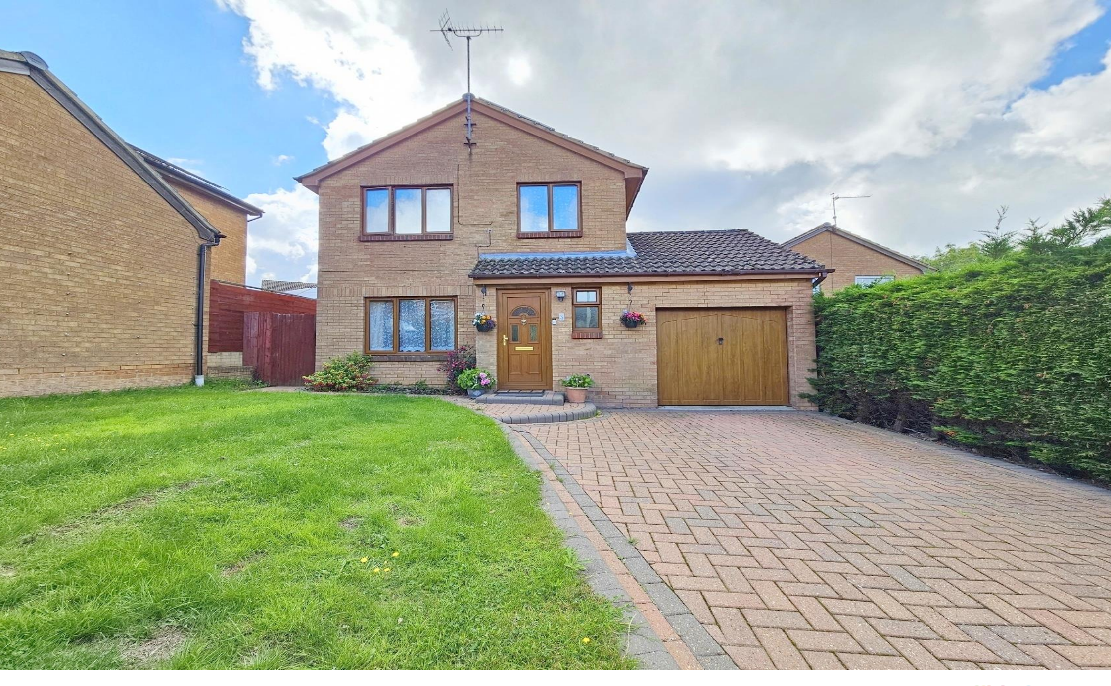
Treeton Close, Lower Earley Reading RG6 4HT