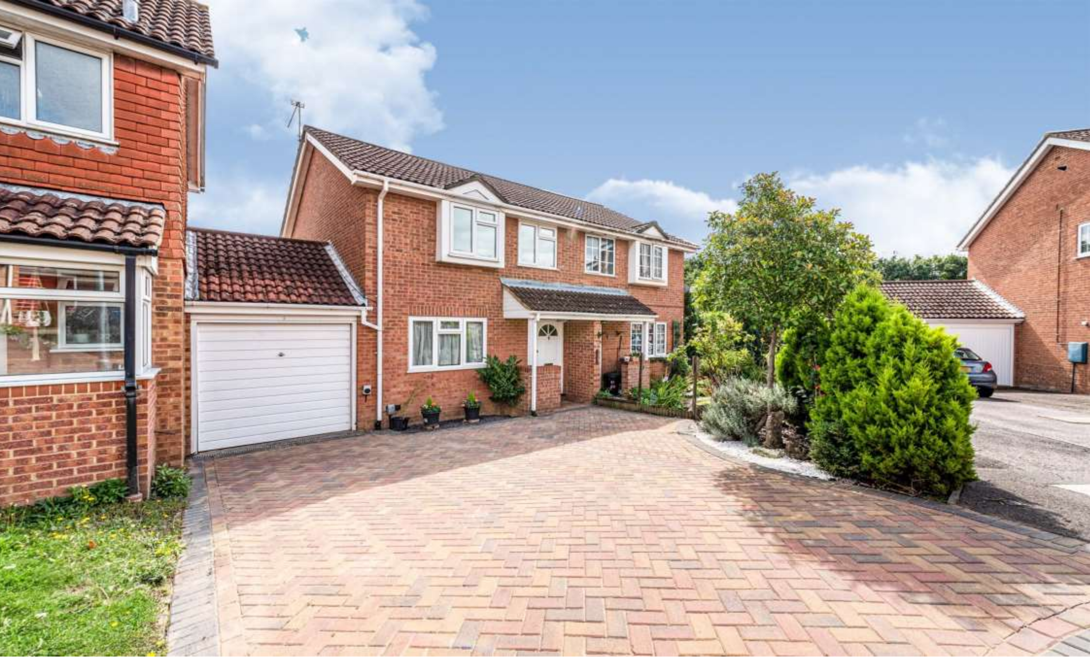
Heacham Close, Lower Earley Reading RG6 4AG