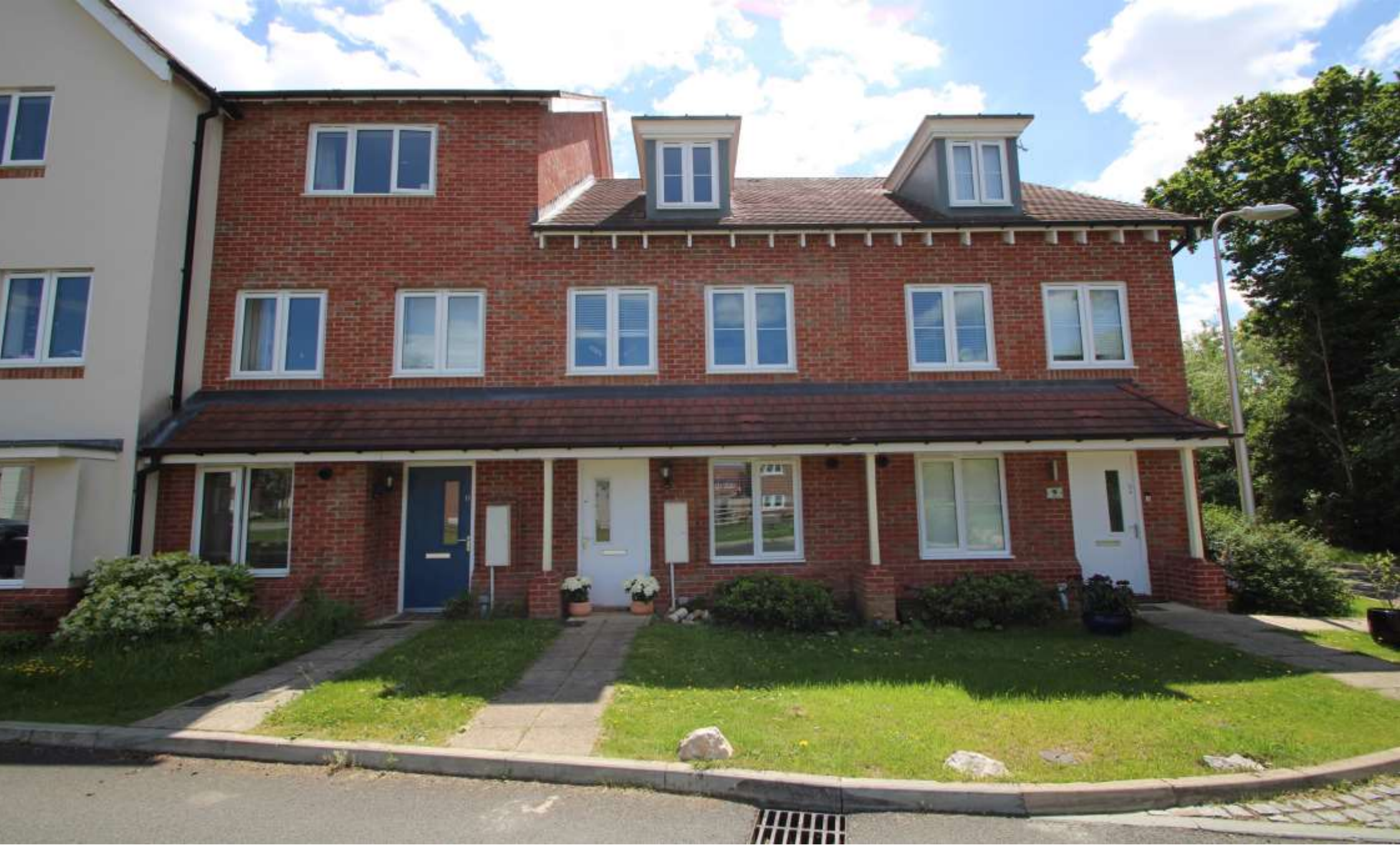
Dahlia, Woodley Reading RG5 4WR