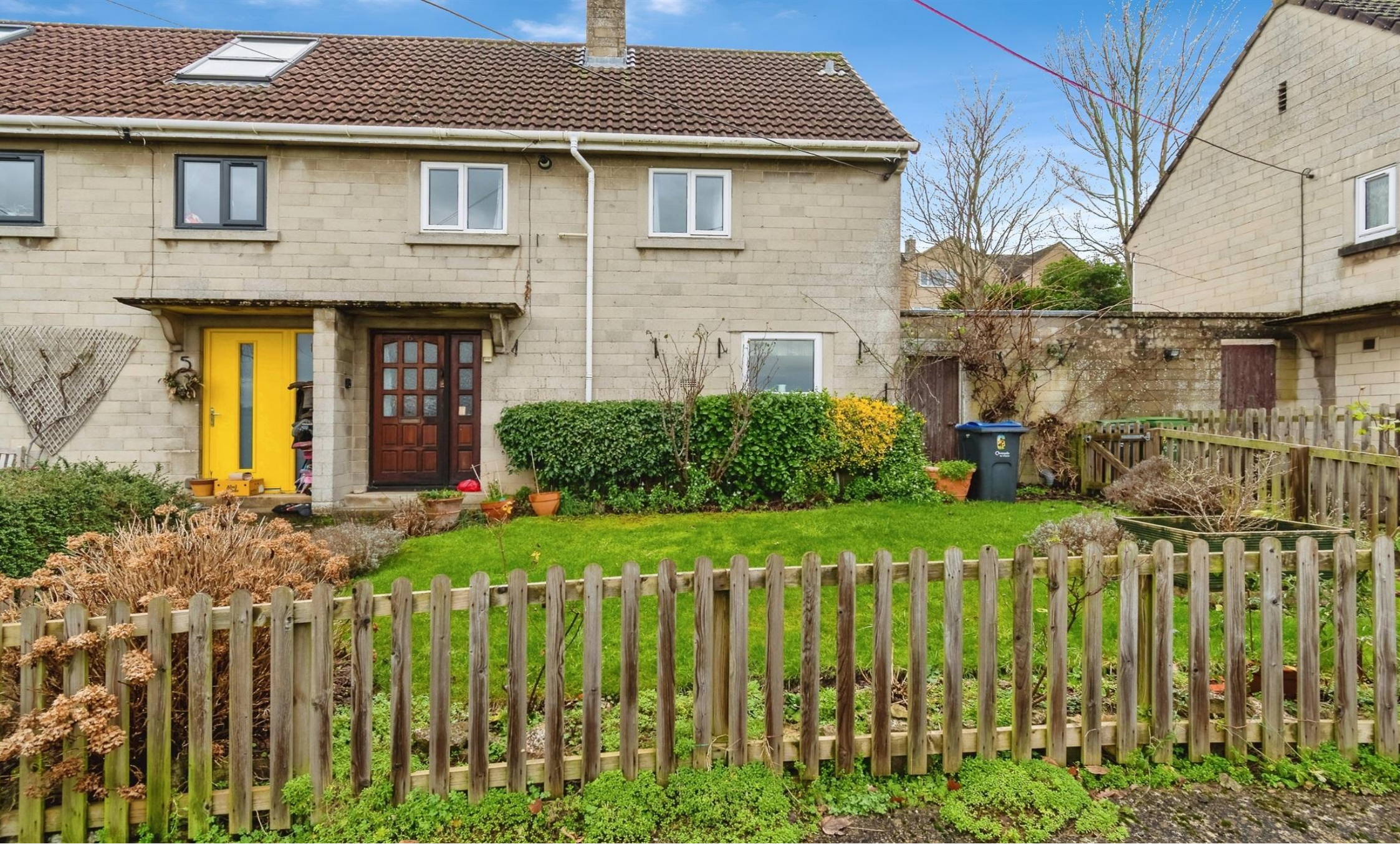
Hazelbury Hill, Box, Corsham, SN13 8JY