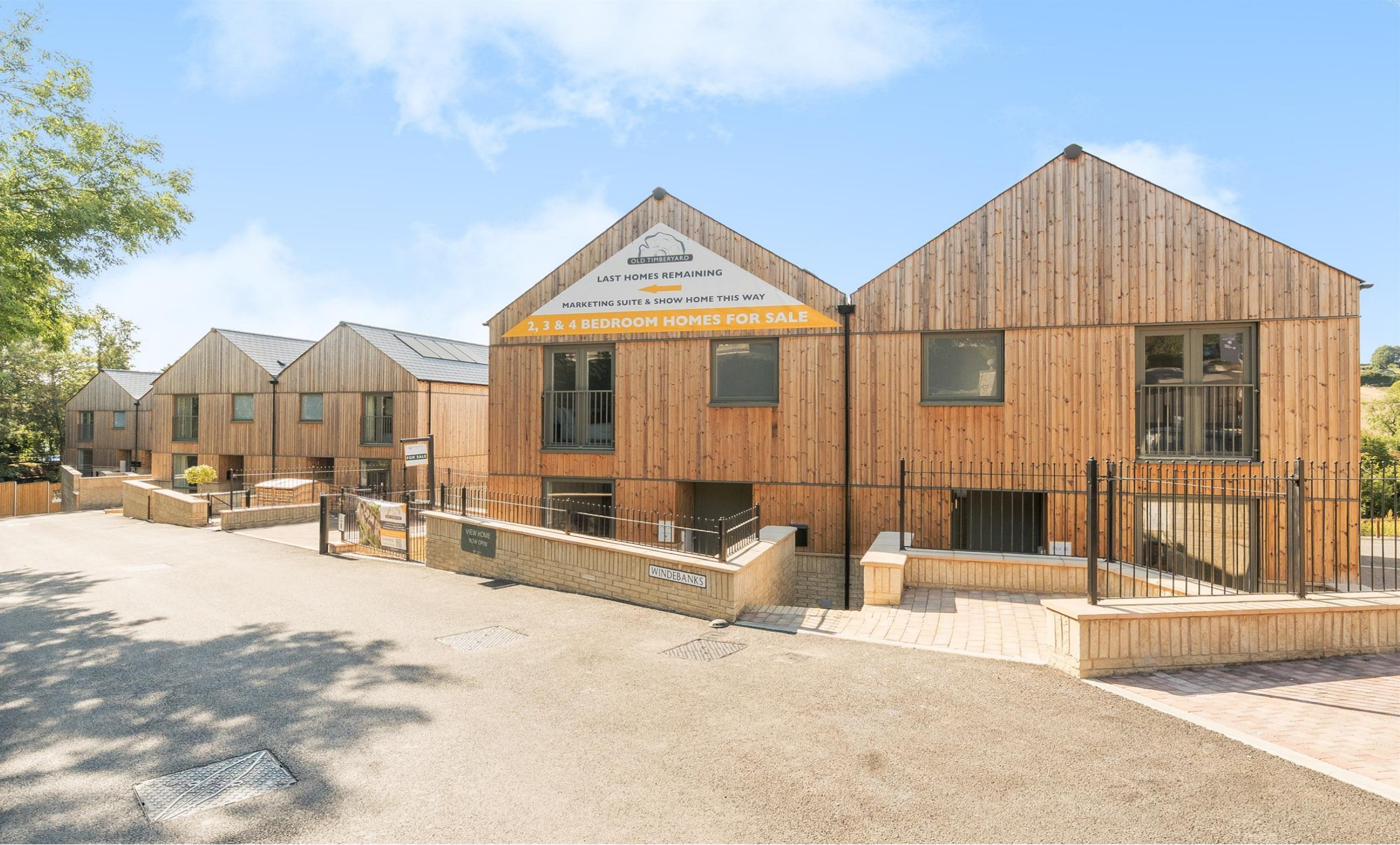
Old Timber Yard, The Wharf, Box, Corsham, SN13 8EP