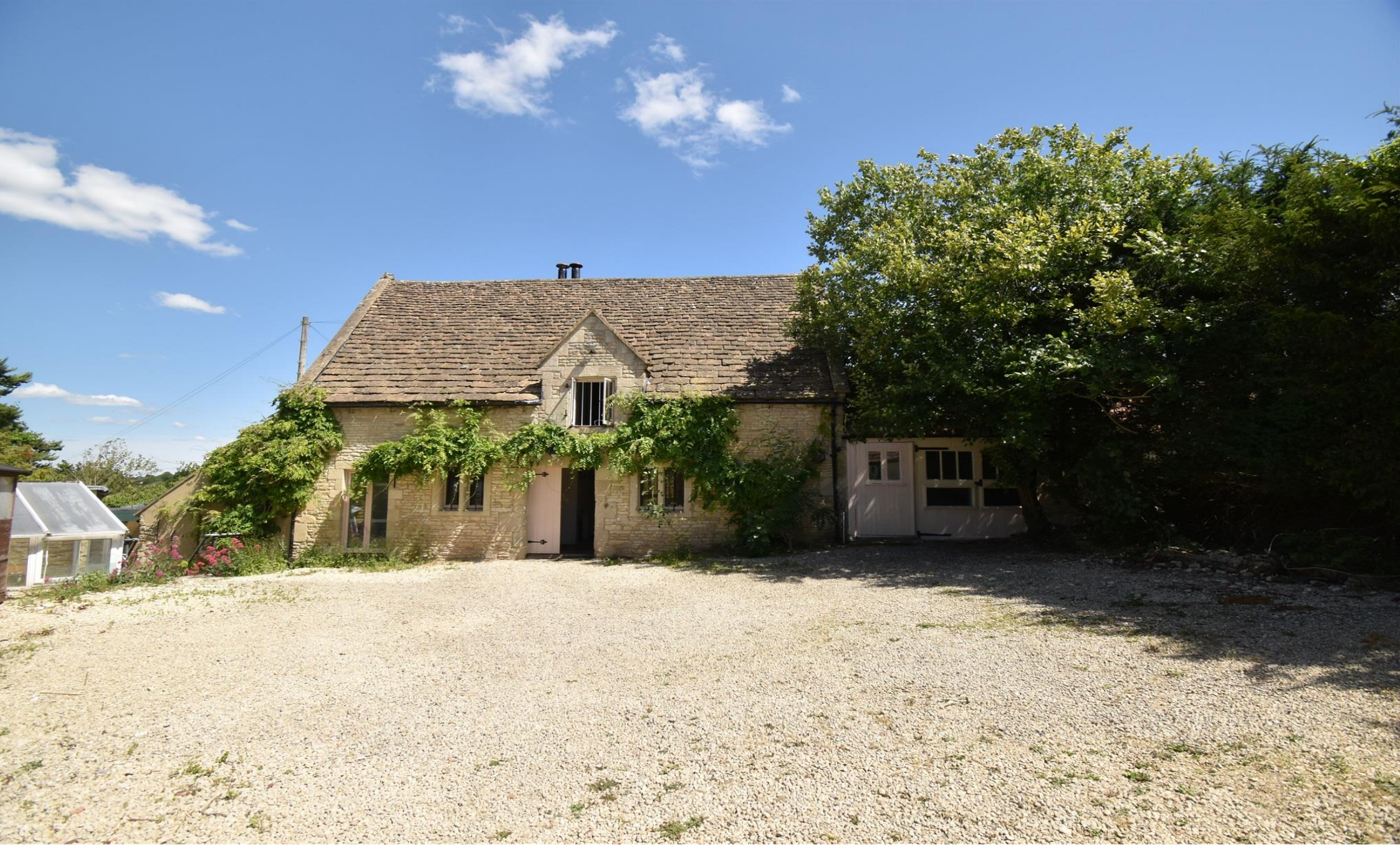
Henley Court Henley, Box Corsham SN13 8BX