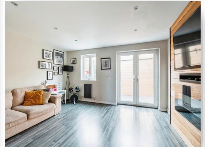
Macie Drive, Corsham SN13 9EJ