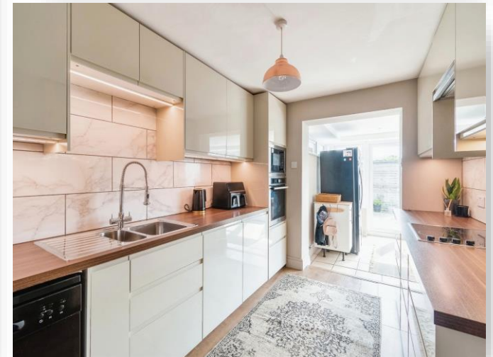
Ashwood Road, Corsham SN13 0LF