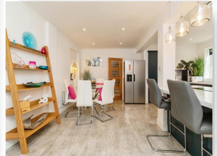
Lothlorien The Bungalows, Corsham SN13 9XS