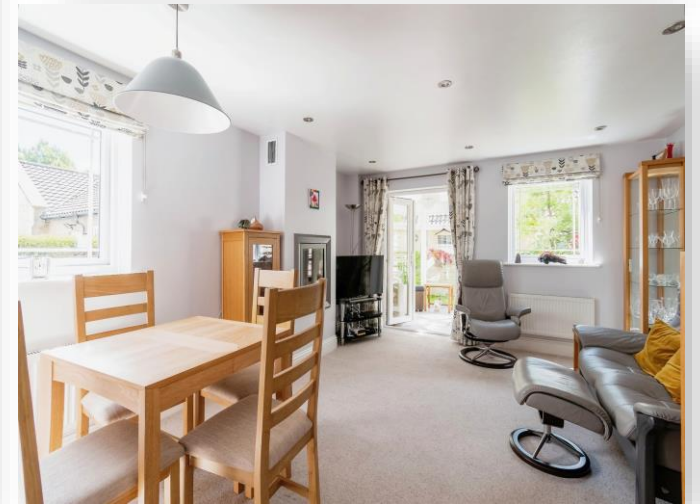
Porters Mead, Corsham SN13 9BA