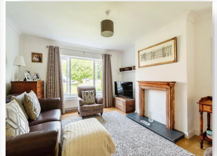
The Beeches, Shaw Melksham SN12 8EP