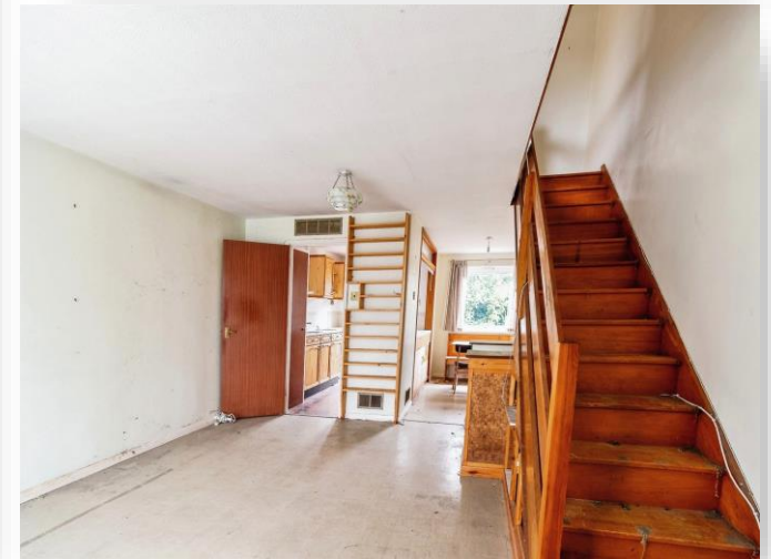
Forrester Green, Colerne Chippenham SN14 8EA