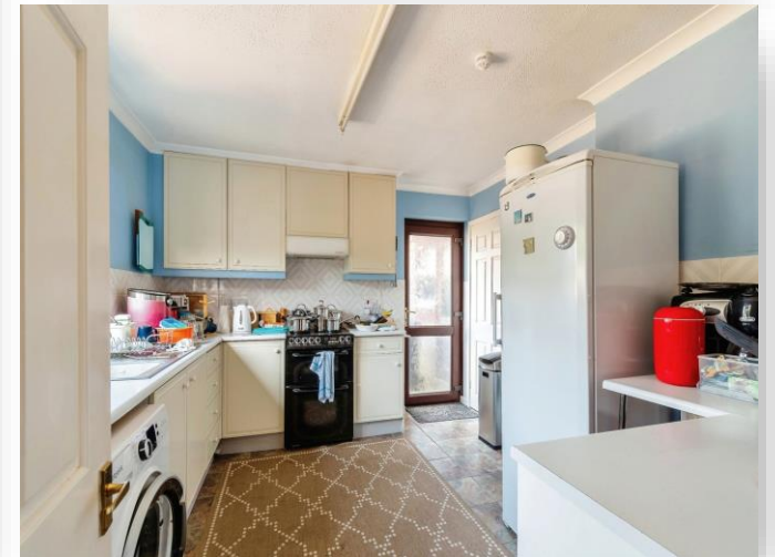
Woodcombe, Melksham SN12 7SD