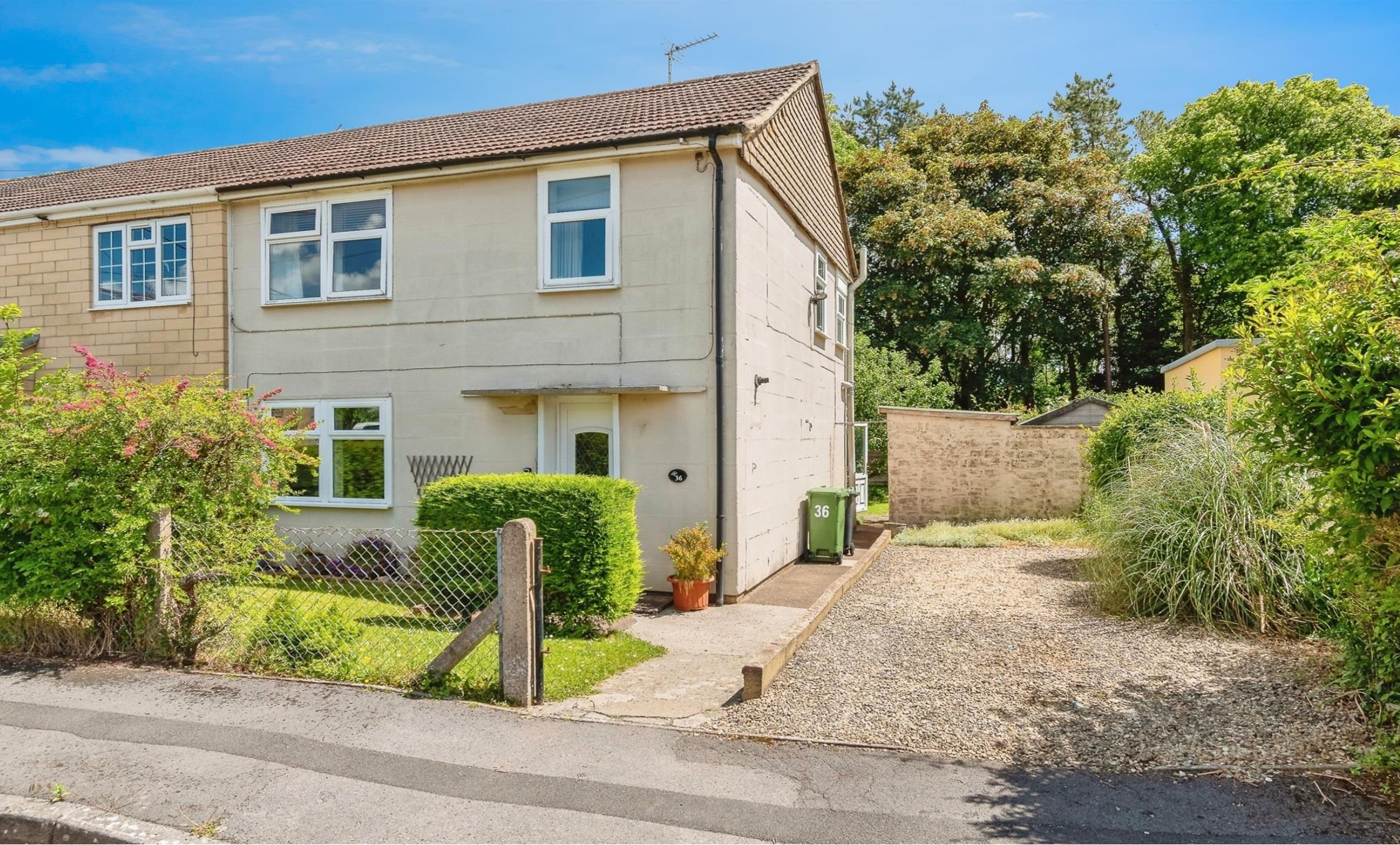
Martins Croft, Colerne Chippenham SN14 8DT