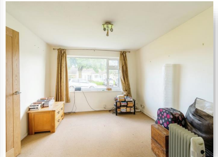
Pine Close, Corsham SN13 0LB